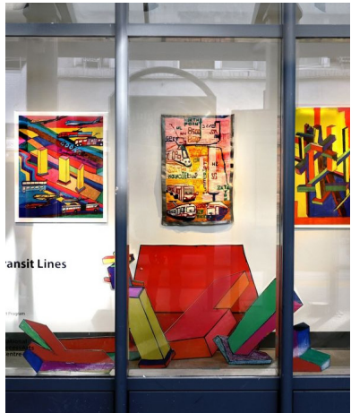
Storefronts in Transition