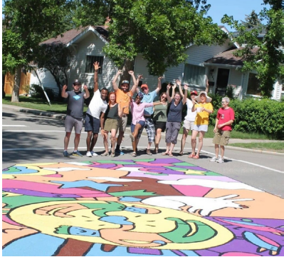
Neighbourhood Vibrancy grant