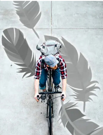
Temporary Sidewalk Art