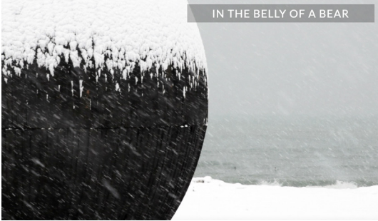
Winter Light Connection